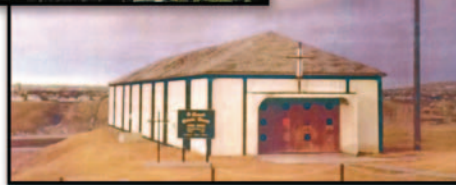
St. Clement was a small and humble church constructed from two 1940 army barracks on the hill in the community of Belfast.